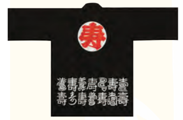
STS-H117/BK 35" Happi Coat (1)