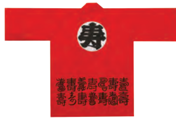
STS-H117/RE 35" Happi Coat (1)