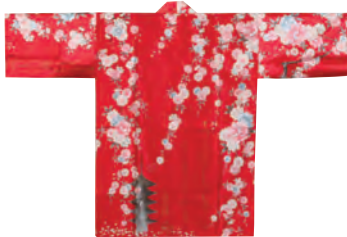
STS-H36/RE 35" Happi Coat (1)