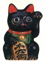
SC7/B* 8.5" H (1/12)