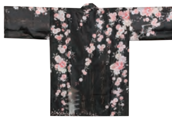
STS-H36/BK 35" Happi Coat (1)