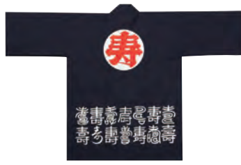
STS-H117/NB 35" Happi Coat (1)