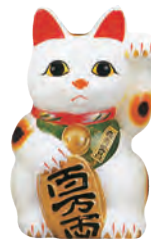
SC8* 10" H (1/12)