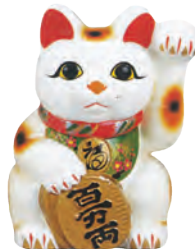
SC10* 12.75" H (1/6)