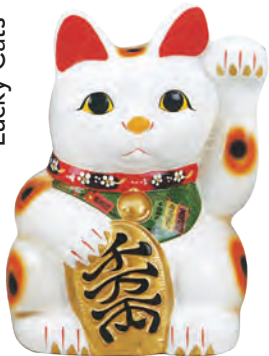
SC15* 18" H (1/2)