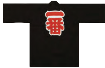
STS-H2/BK 35" Happi Coat (1)