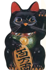
SC8/B* 10" H (1/12)