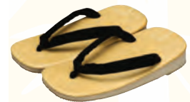
LS40/L 9.75" L (5/60)