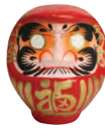
DA-5 7" H (1/60)