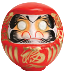
DA-7 9.5" H (1/24)