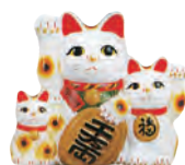
SC37* 6.75" H (1/24)