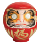
DA-3 5.5" H (1/100)