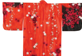
STS-K19/RE 56" Kimono (1)