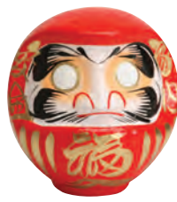
DA-6 8" H (1/36)