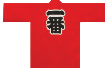
STS-H2/RE 35" Happi Coat (1)