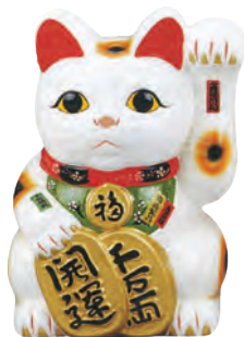
SC13* 15.75" H (1/4)