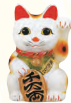
SC7* 8.5" H (1/12)